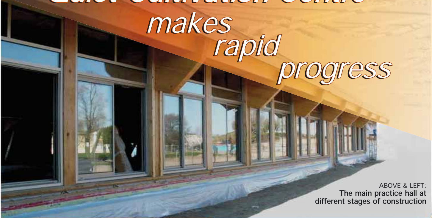
ABOVE & LEFT: The main practice hall at different stages of construction