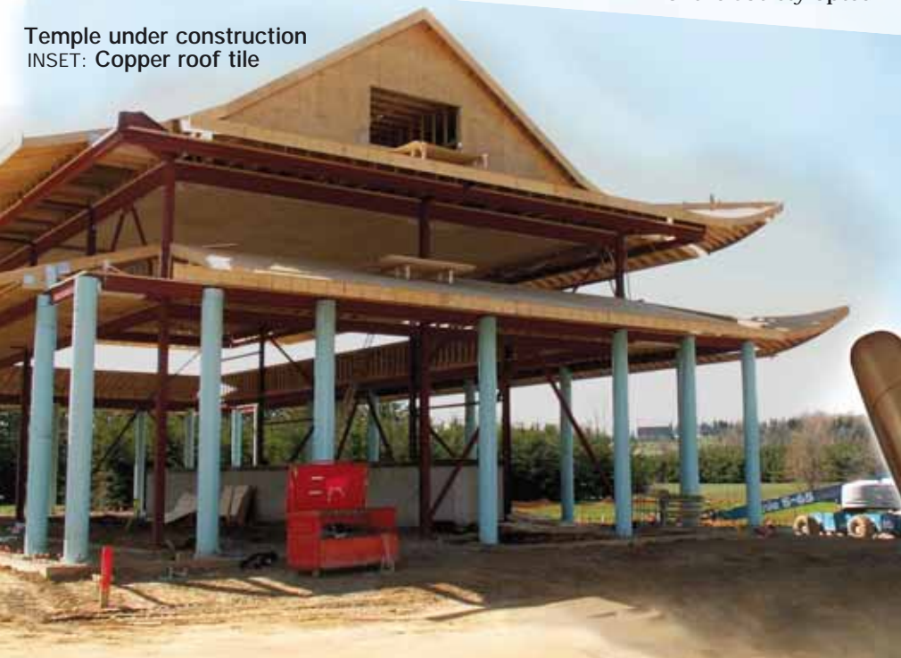
Temple under construction INSET: Copper roof tile