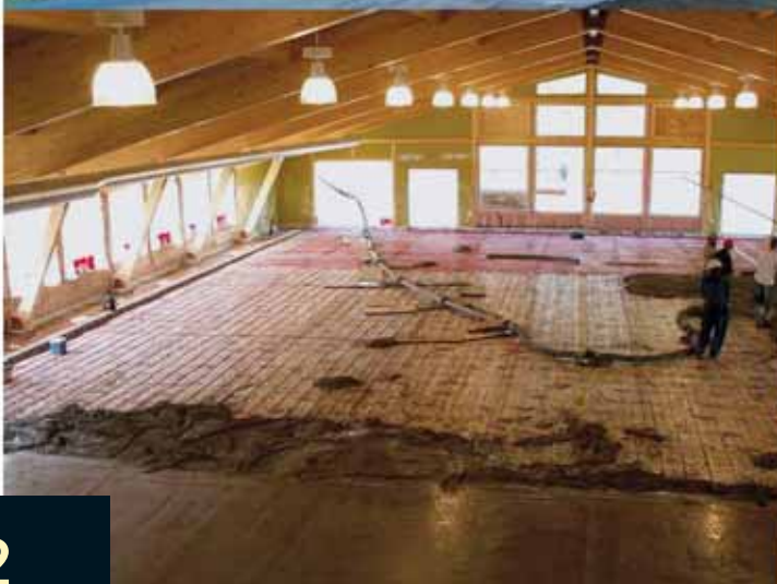
LEFT: Main practice hall floor being laid BELOW: Meditation rooms